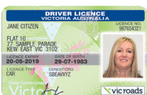
Australian driver licence