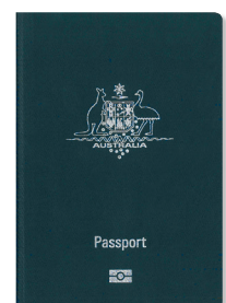
Australian or foreign passport