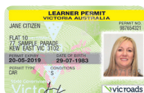
Victorian learner permit