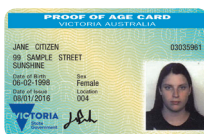
Proof of age card