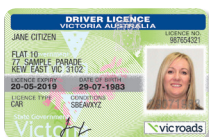
Australian driver licence