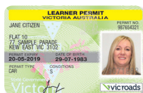
Victorian learner permit