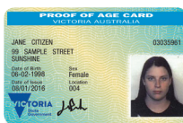
Proof of age card